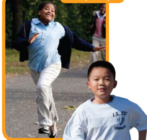
IS 237, Queens, NY