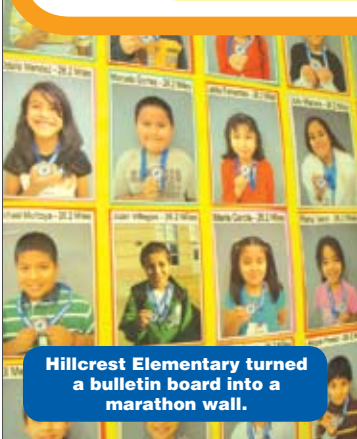
Hillcrest Elementary turned a bulletin board into a marathon wall.

● Events to Run: We created a free online collection of resources and guides to help you stage fun athletic events for your students. Visit www.nyrrf.org/events to organize a fun run, track meet, field day, and more.