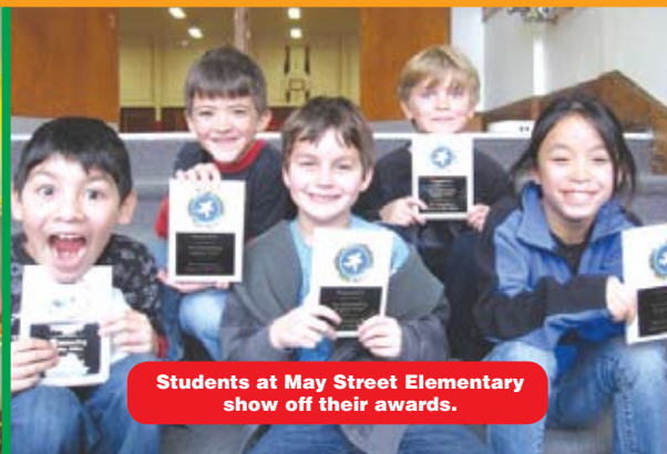
Students at May Street Elementary show off their awards.